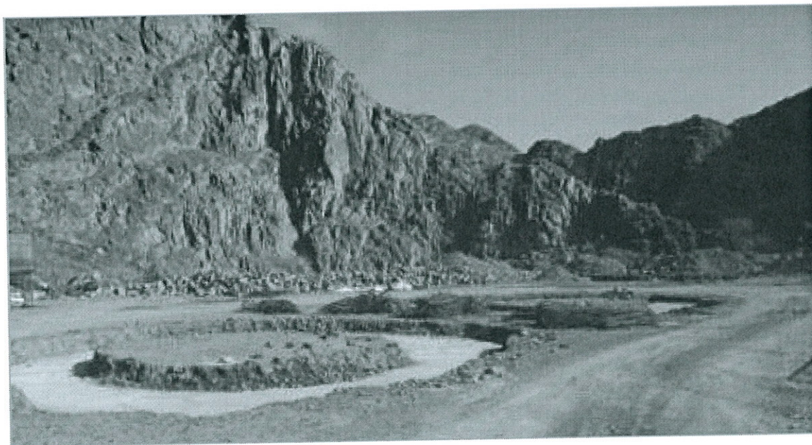
Power Island Area: Oil Tank