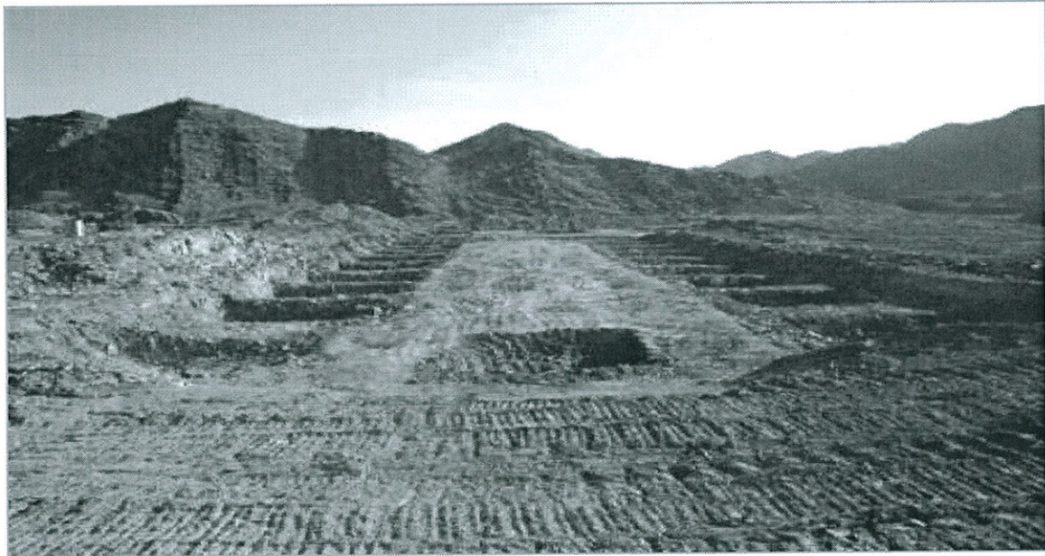
Power Island Area: Generator Room