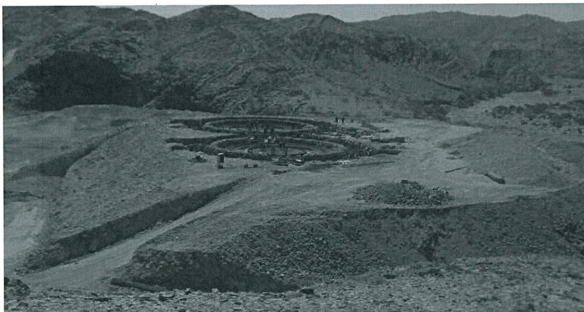
Processing and Smelting Area: Thickening Tank Area