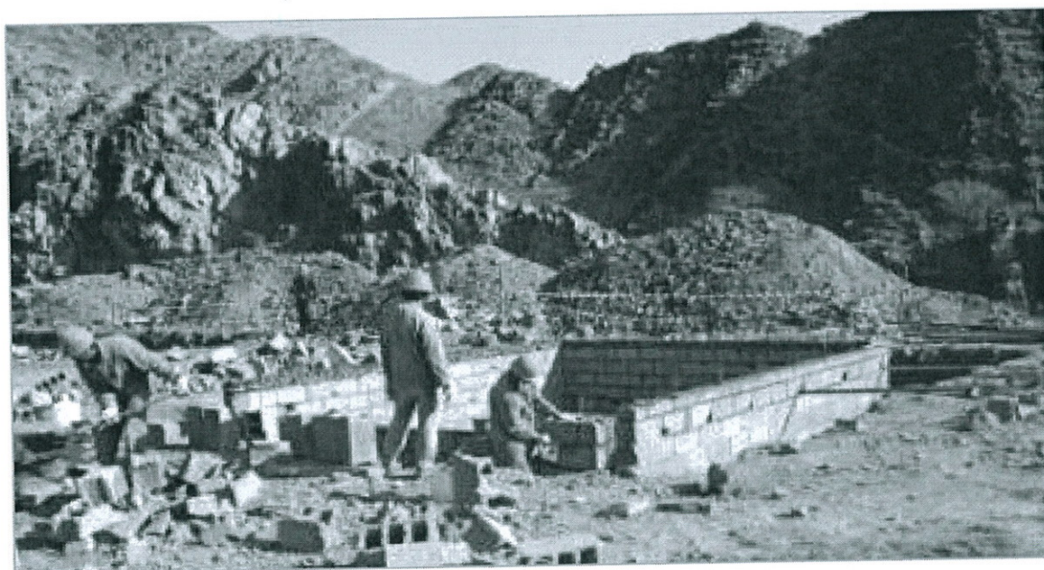
Power Island Area: Barrel House