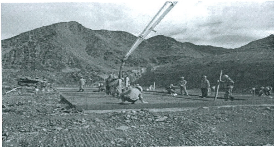
Auxiliary Facility: Comprehensive Office and Test Lab