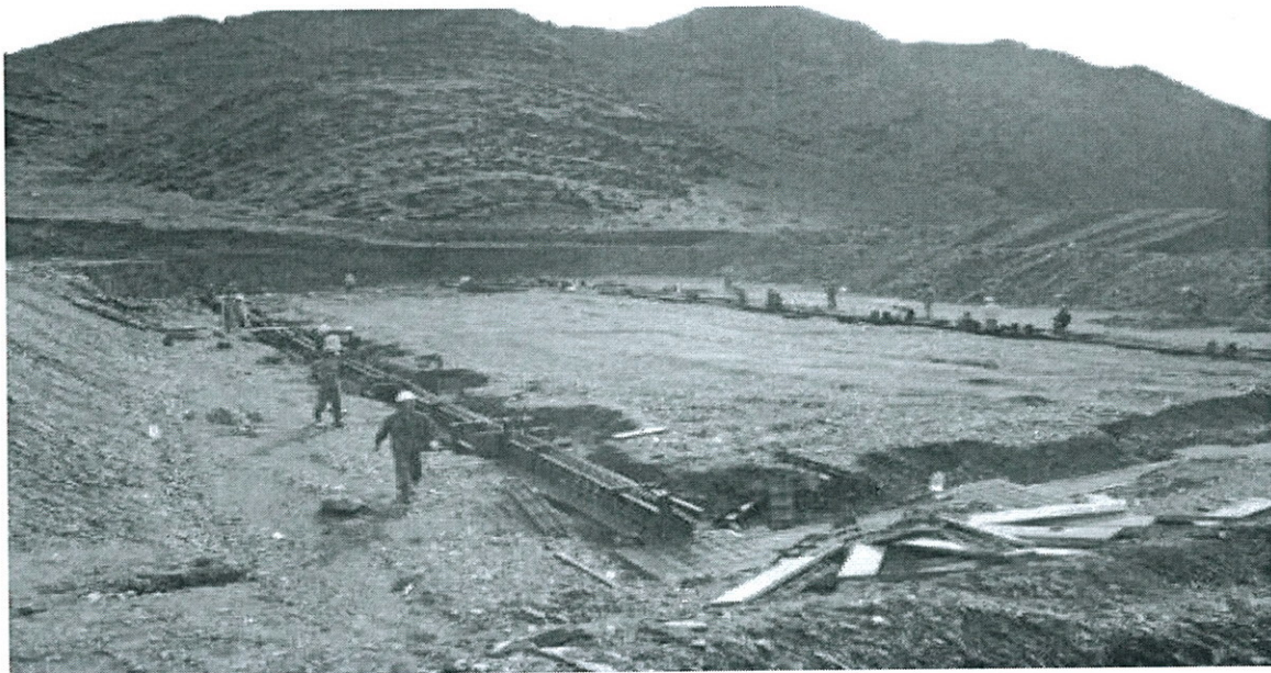
Auxiliary Facility: Comprehensive Warehouse