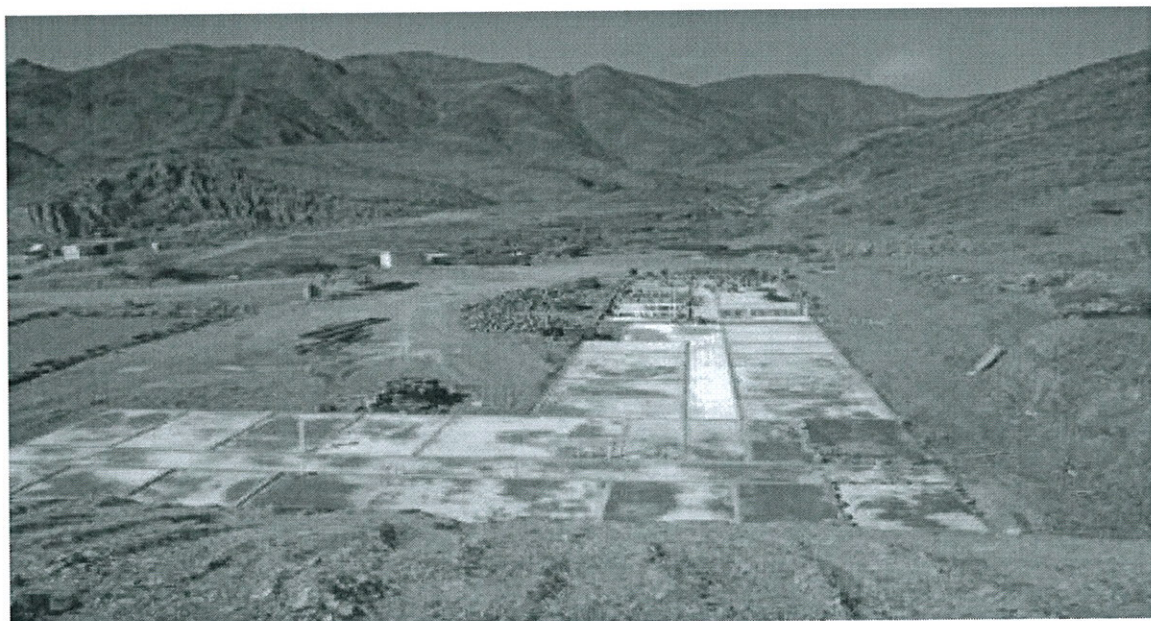
Auxiliary Facility: Comprehensive Office and Test Lab