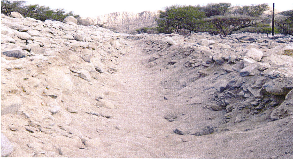
Pipe Line Excavation