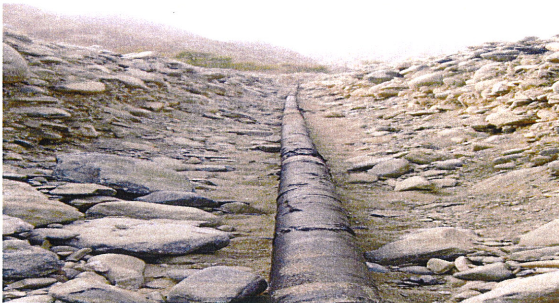
Piping Installed for Water Supply System